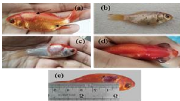
Figure 1. Physical condition of comet fish seeds after bacterial infection

Description: (a). Purulent wounds at the injection site and enlarged stomach, (b). Scales falling out, (c) reddish spots, (d) bulging eyes, (e) widening wounds