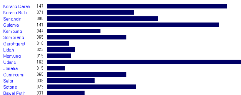
Figure 3. Analysis of Marine Fishery Potential Commodities in Rokan Hilir Regency

Synthesis with respect to: Goal: Analisis Potensial Produk Unggulan Agroindustri Perikanan Tangkap Rokan Hilir Overall Inconsistency = .27